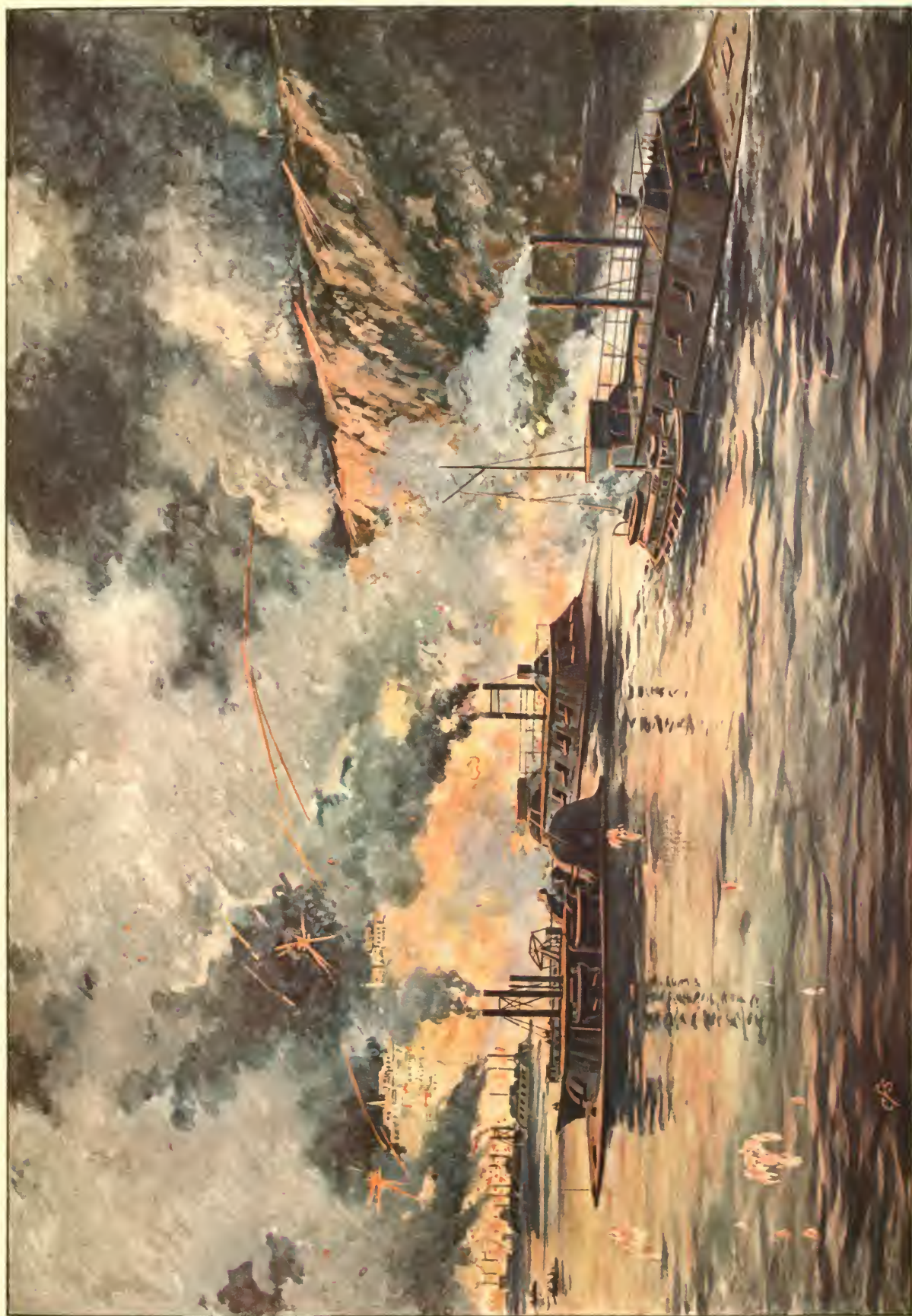
REAR-ADMIRAL PORTER'S FLOTILLA ARRIVING BELOW VICKSBURG NIGHT OF April 16, 1863