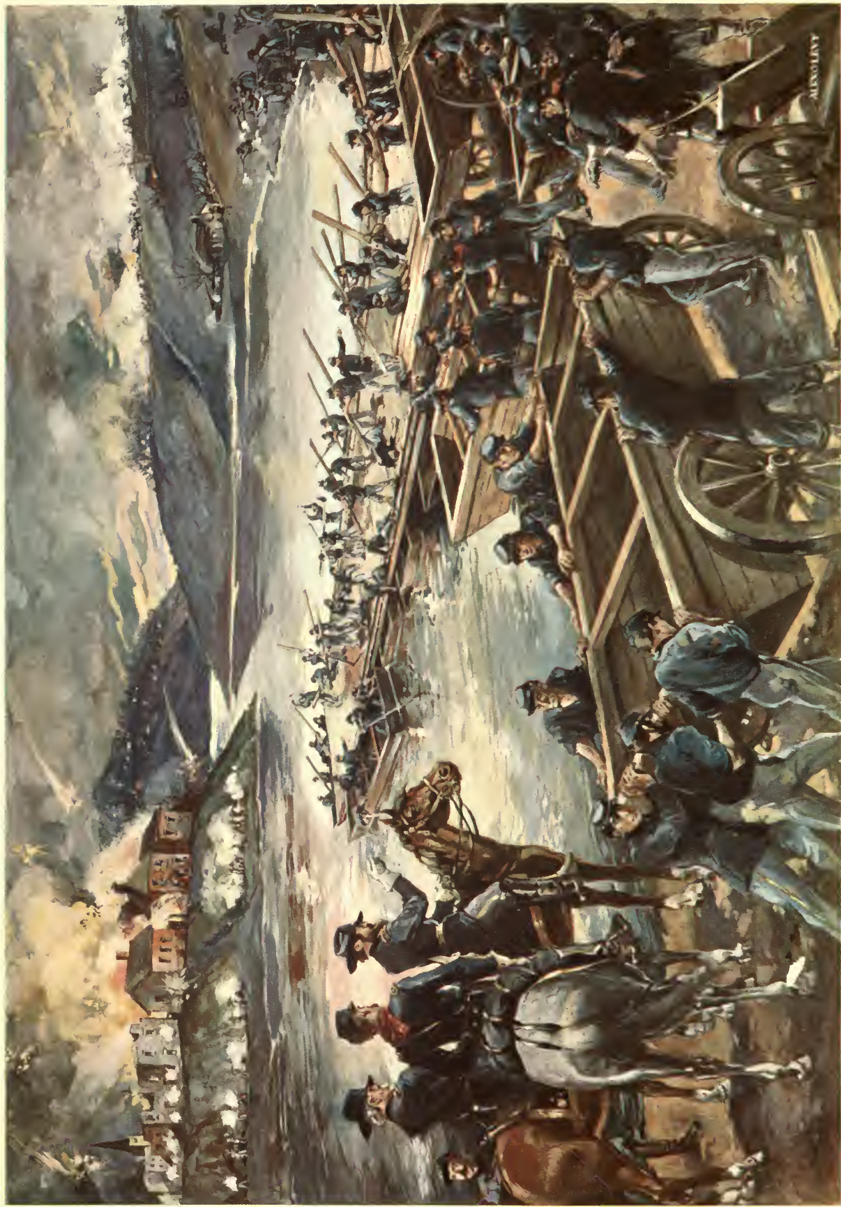
BATTLE OF FREDERICKSBURG, VA.

THROWING THE PONTOONS ACROSS THE RAPPAHANNOCK IN THE FACE OF THE CONFEDERATE SHARPSHOOTERS, DEC. 11, 1862